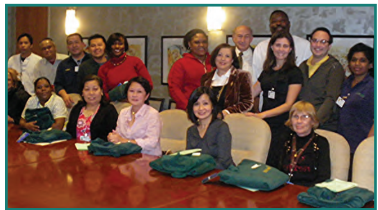
2010 - JHR Employee Recognition Ceremony - Honoring employees who've helped us make a difference for 5 years